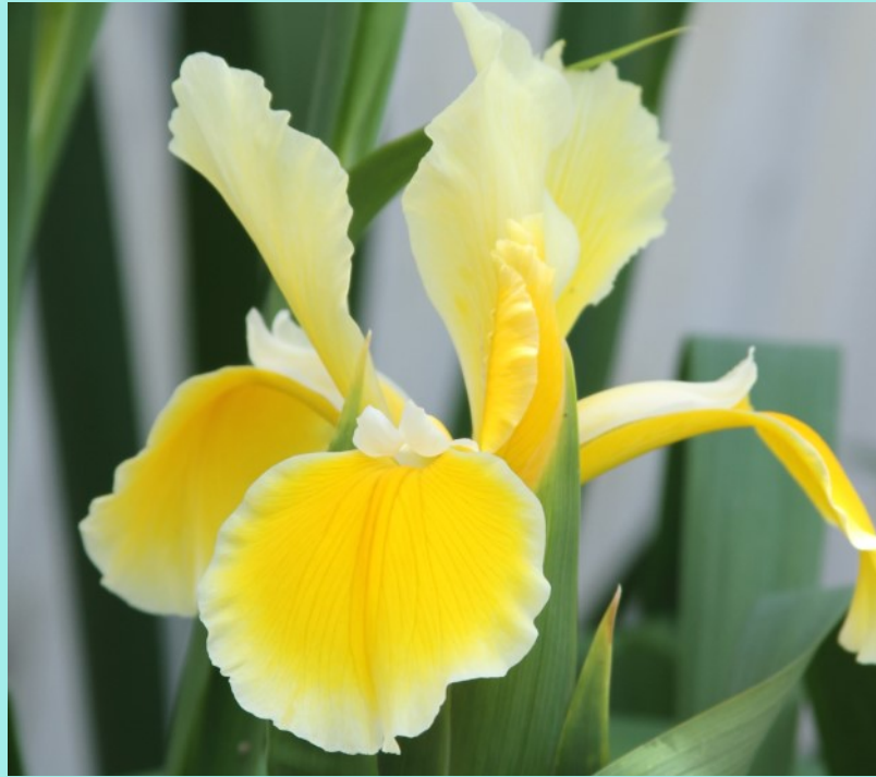
Dandelion Smile SPU (Cadd 2005) BEST SPURIA AWARD