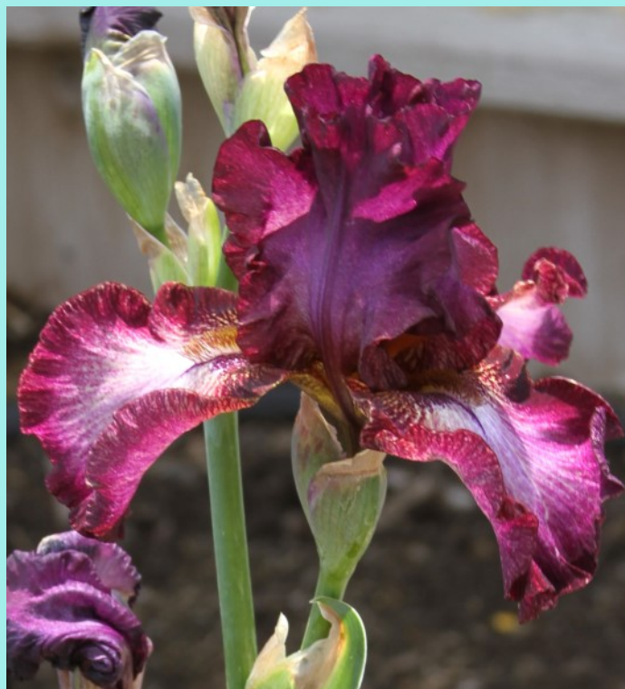
Seedling V13-3A (Hedgecock) BEST OUT-OF-REGION SEEDLING AWARD